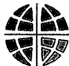
Bishop Amy Current

Southeastern Iowa Synod Evangelical Lutheran Church in America